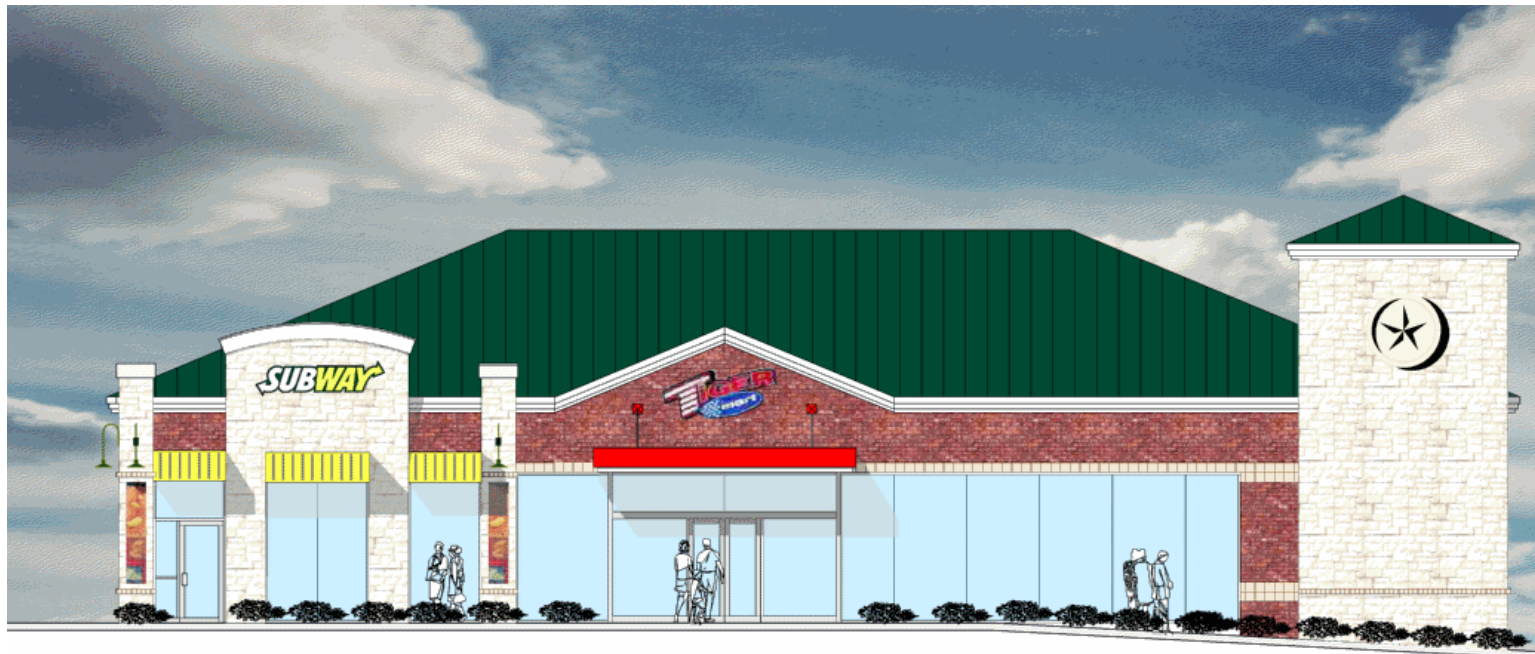
PROSPER TIGER MART